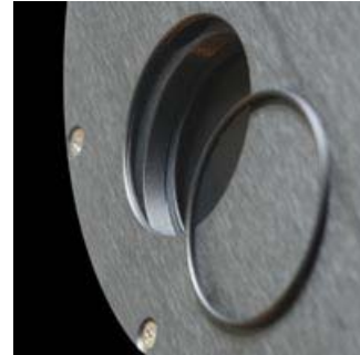
CFW-2-7 New threaded retaining ring system